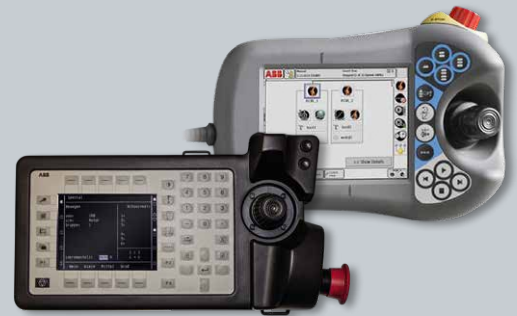
ABB FlexPendant Units Teach Pendant Units